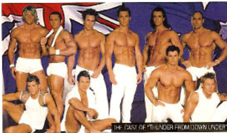
THE CAST OF "THUNDER FROM DOWN UNDER"